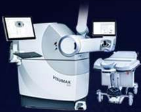
ZEISS VisuMax SMILE