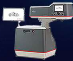
Elita SILK Lenticule