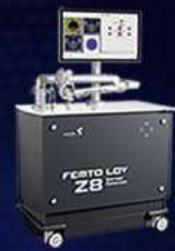
Ziemer FEMTO platforms